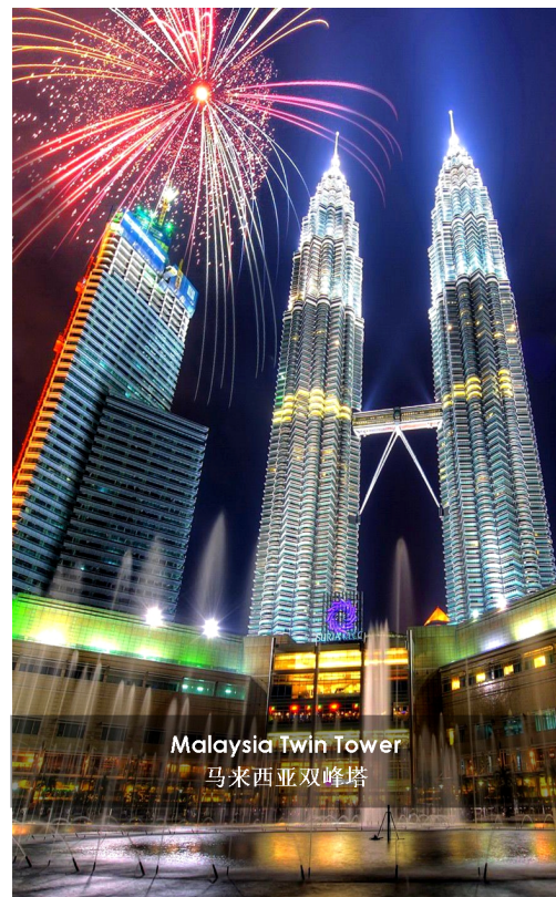
Malaysia Twin Tower 马来西亚双峰塔