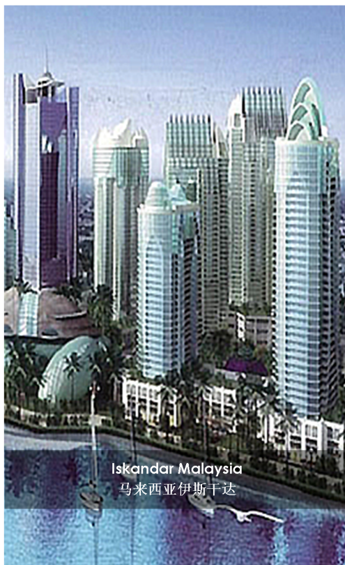
Iskandar Malaysia 马来西亚伊斯干达